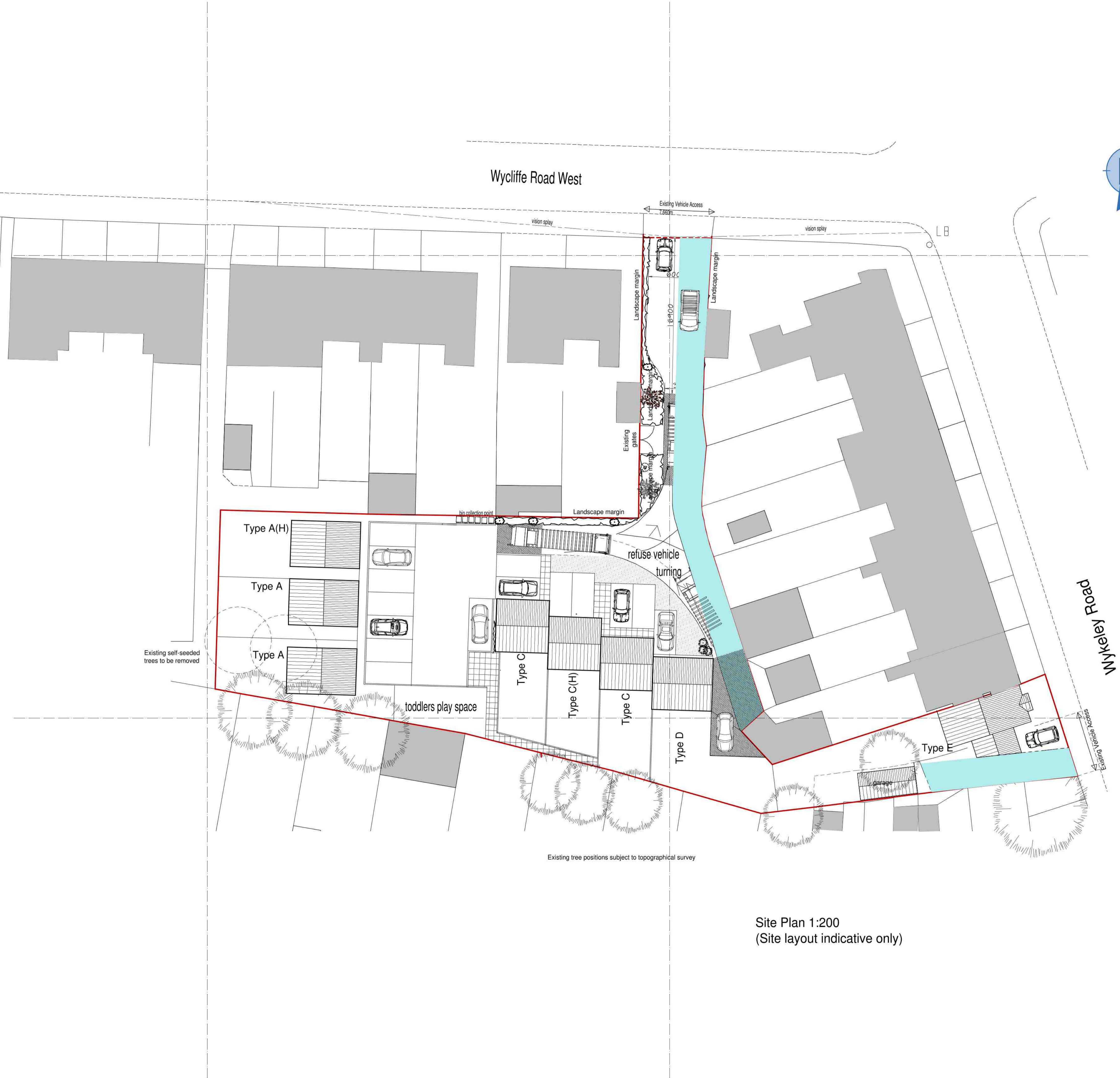
Site Plan 1:200 (Site layout indicative only)